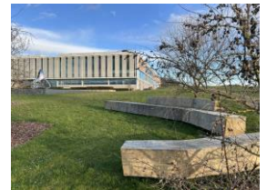
A place to sit in the WITTENSTEIN World Garden: A popular spot for a break.

The WITTENSTEIN group develops, produces and sells gearboxes, motors and electronics, as well as high-precision drive systems and solutions, nanotechnology and specific software solutions.